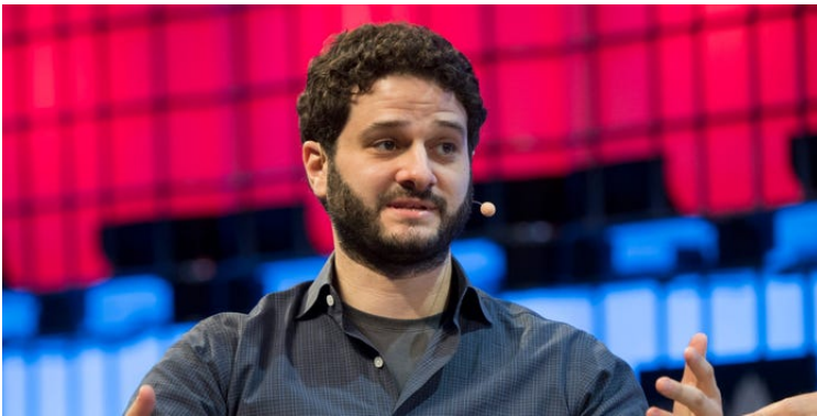
Asana founder Dustin Moskovitz made a strong accusation against Tesla on Wednesday.